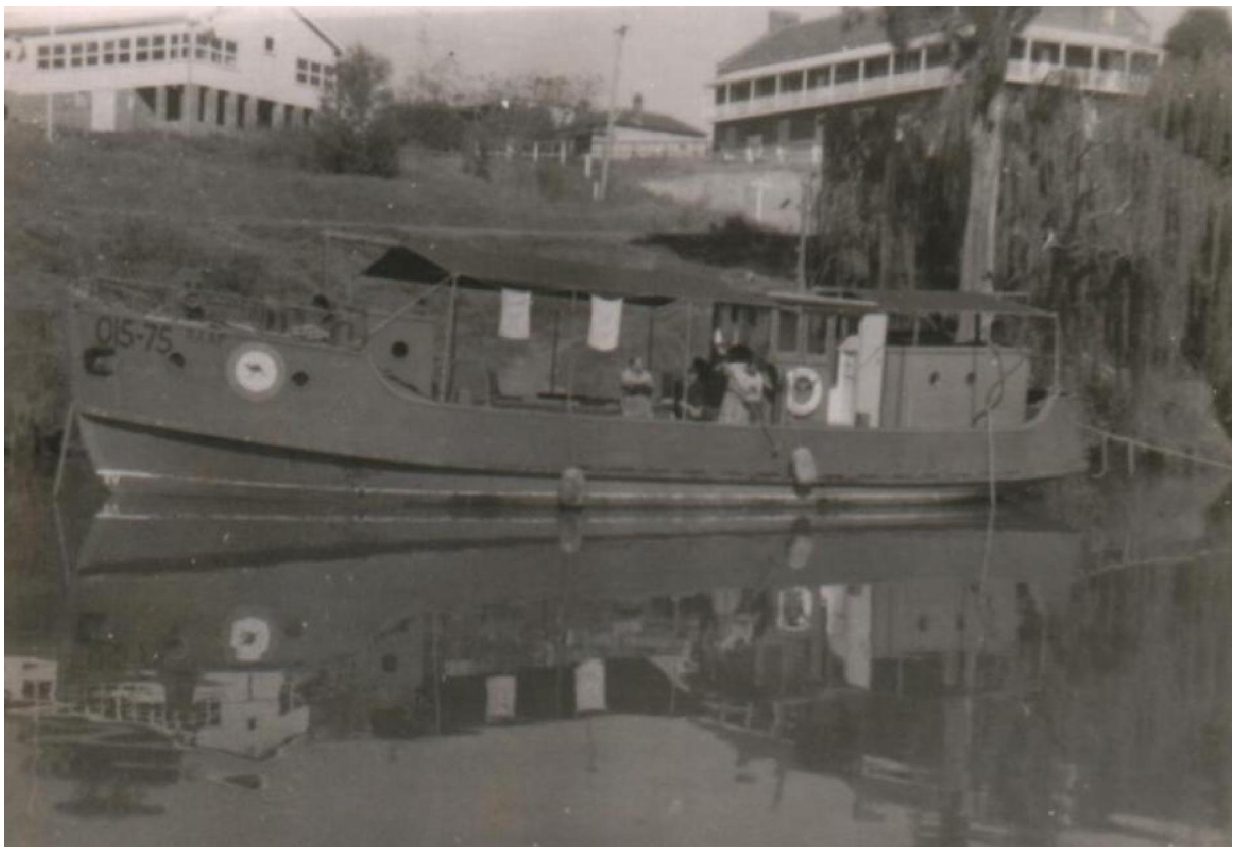
015-75 at Windsor after delivering the hangar doors, with the Royal Hotel on the right.

The demise of the RAAF Marine Section came in 1964 when the Neutral Bay establishment was handed over to HM Customs. By that time I was watch-keeping on AV1355 Vernon Sturdee in Borneo".