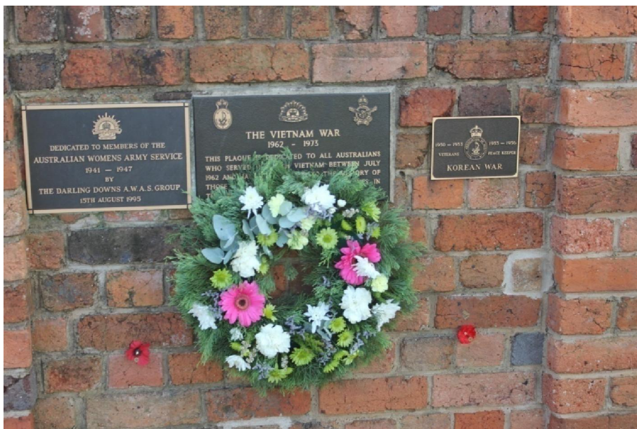
Vietnam Memorial near main 'Mother's Memorial Toowoomba