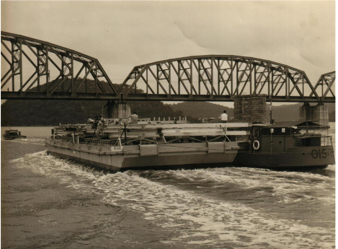
RAAF 56ft wooden cargo vessel, 015-75 approaching Windsor Bridge with a 100ft Philippine Lighter with a hangar door on top. A 40ft workboat leads the way.

WO Bill Ringland, our skipper, contacted our CO at Neutral Bay to report our lack of suitability as an ocean tug, and we returned to base and discussed a solution to the sea tow. After a few days off, we made ready for the next run when we would pick up the second hangar door